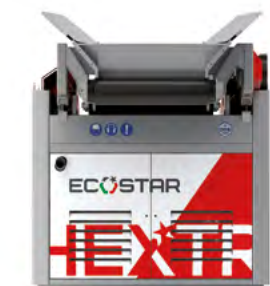
Hextra hooklift version