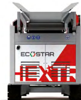
Hextra track version